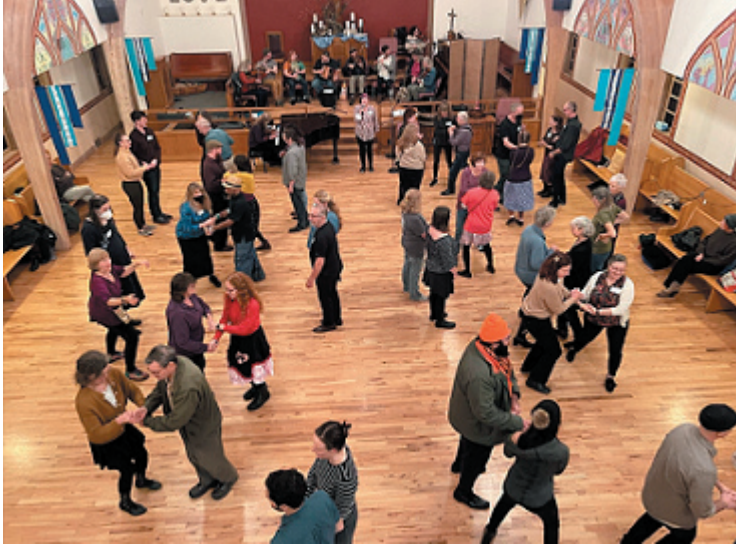
Rambling House Céilí Mór