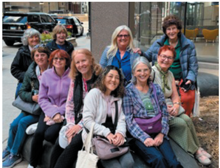
The gang tours downtown Chicago

Over 30 of our branch members attended the long weekend this year. Amazing!