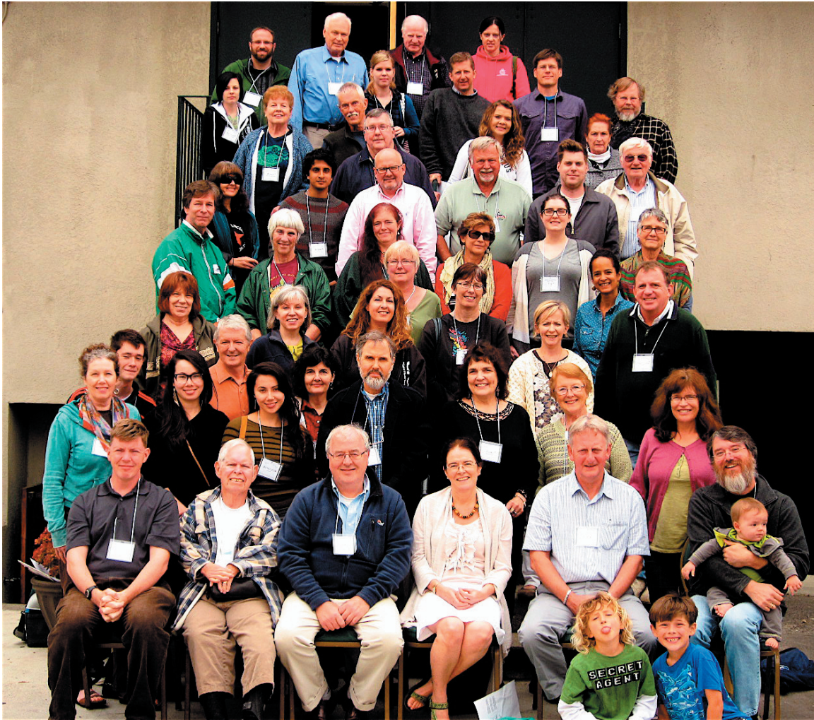
Deireadh Seachtaine Gaeltachta participants gather for a group photo