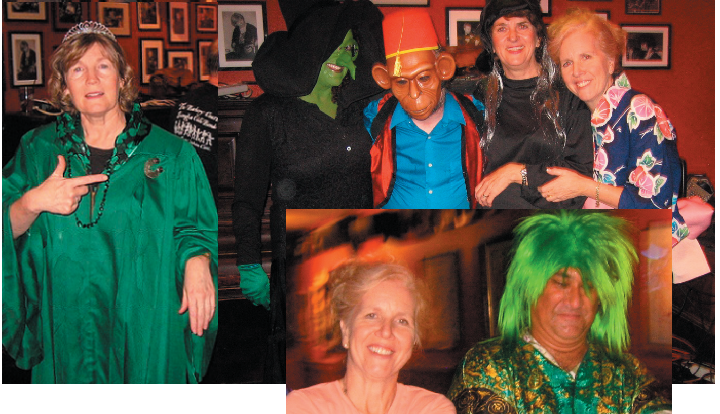
Halloween at the Plough and Stars had a Wizard of Oz theme. Dorothy, the Scarecrow, Tin Man and Fearless Lion provided the entertainment. Queen Maeve, the good and evil witches together with the monkey and the geisha girl danced. A grand time was had by all.