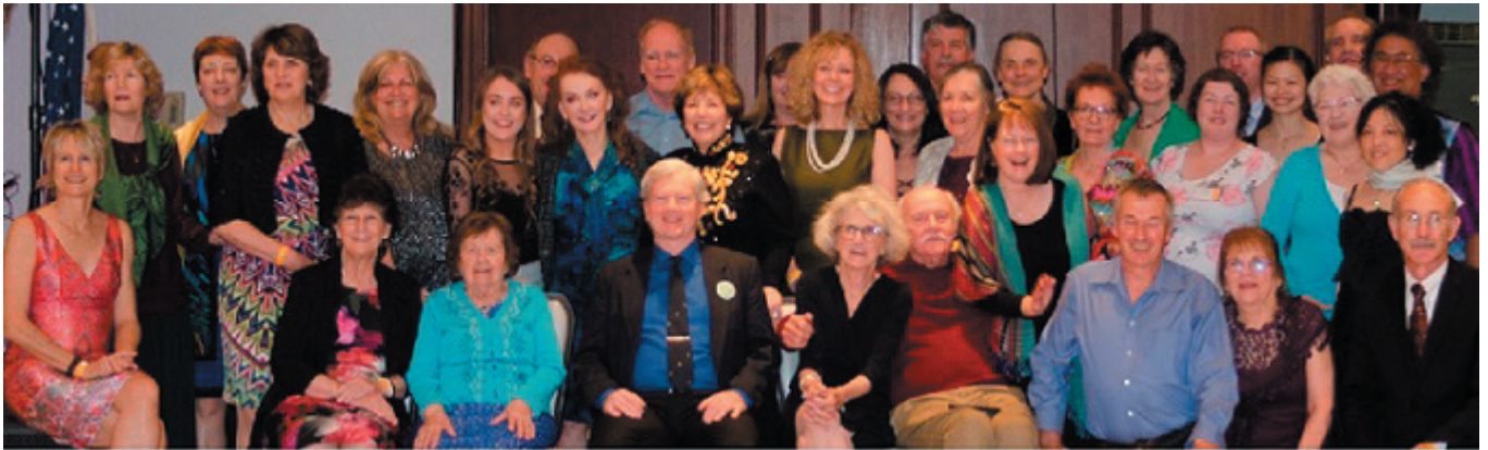
San Francisco always has one of the larger groups at CCÉ Conventions

Old acquaintances were renewed and many new ones made as we danced the day and night away and witnessed some lovely music sessions. Our special “farewell dinner” on Sunday night was filled with song, chats, laughter and a great meal. While “what happens in Chicago stays in Chicago”, the convention can be full of surprises! For some, a break from the whirlwind music and dance is a trip to the sauna, back to the dance floor, back to the hot tub and back for late night dancing...all without missing a step!