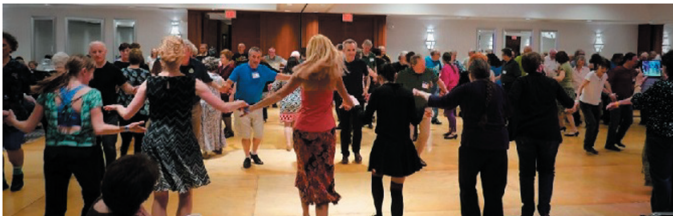
A long weekend filled with dancing, music and fun!!